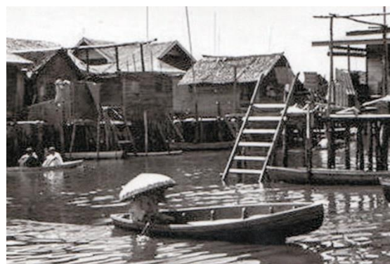
Figure 3 Types of old houses in Kampong Ayer in the year 1950s