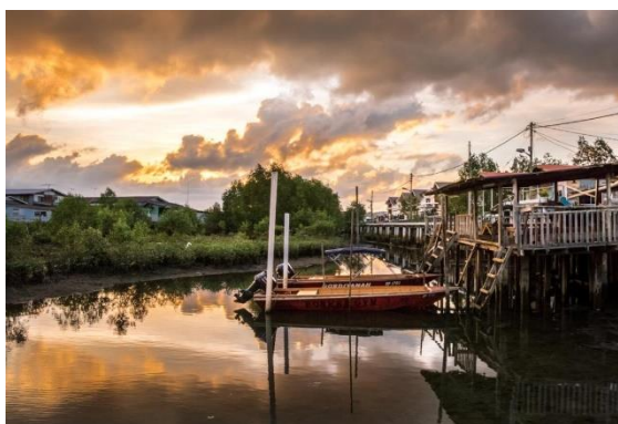
Figure 1 A view of Kampong Ayer