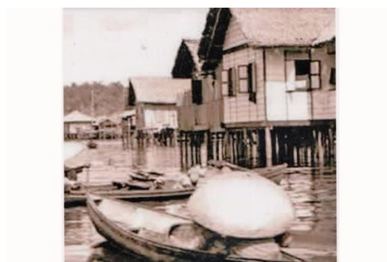
Figure 4 Rumah Belah Bubung

'Rumah belah Bubung' is one of the mostly used types of house in Kampong Ayer as the roof is shaped like an upside-down letter 'V' and it also has a horizontal bone roof structure. Before the modern era, the rooftop is made from arranged 'nipah' leaf and 'kajang' leaf where it is commonly used as it is easy to fix and install. Other than that, there is another roof which is called 'Sarani' roof that have the same characteristics and shapes as to rumah belah bubung where it was not known where it came from but are still categorized under rumah belah bubung. On the other hand, rumah belah bubung is one of the houses that is simple that makes it easy for the homeowner to repair and replace the roof in the event of damage, this is because it is one of the easiest roofs to build than 'rumah tungkup'.