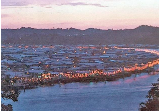
Figure 5 Kampong Ayer in the year 1970

easily obtained from the forest. The name for harvesting the woods is called 'beramu', when harvesting the woods to build a house it is depending on the persons own free will which is only can be done in the morning. All the woods are then chosen and picked according to woods durability.