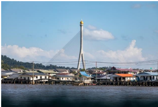
Figure 6 Kampong Ayer in the year 2019

Brunei Malay Kampong Ayer houses nowadays are mostly from bricks, concretes, cements, metals, sands and others on which all the ingredients to make it are bought locally and imports. However, the woods are used to build the roof and flooring are still used but different types-stained timber now can be bought from the industry of this country.